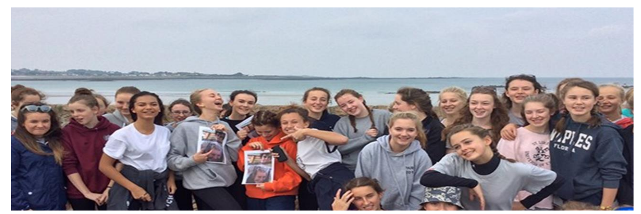
Over 50 girls from Lower Five completed their Bronze Duke of Edinburgh Award Practice and Qualifying expeditions on the 10<sup>th</sup>/11<sup>th</sup> October 2015.

The commitment to volunteer work in the community and the undertaking of physical and skill based activities becomes progressively more extensive and the expeditions become more and more challenging as a student progresses through the levels. The experiences gained in attaining these levels are rewarding in themselves but each award is highly regarded by employers and universities.