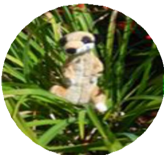
Marvin the Meerkat Curiosity (Be curious)