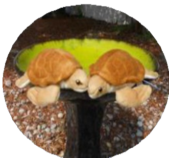
Tim and Tina Turtle Collaboration (Be co-operative)