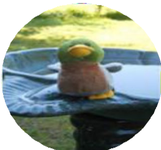
Desmond Duck Resilience/Perseverance (Don't give up)