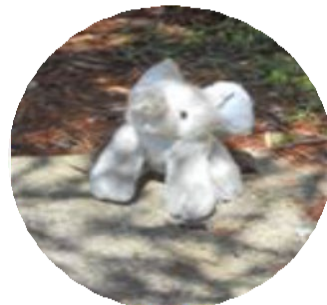
Ellie the Elephant Initiative/Independence (Think for yourself)