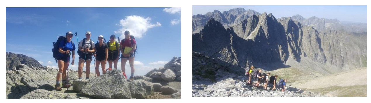
Gold participants on their qualifying expedition in the Tatra mountains, Slovakia - 2018

Since its creation in 1956 by HRH The Duke of Edinburgh, the award programme has gone from strength to strength. Guided by a set of principles, and by the young people themselves, it is as relevant today as it was when it was first created.