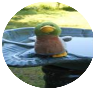
Desmond Duck Resilience/Perseverance (Don't give up)