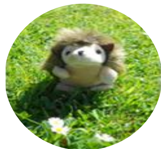
Hamid the Hedgehog Risk Taking (Have a go)