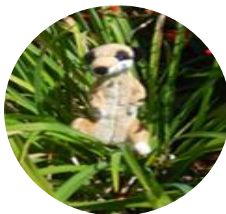
Marvin the Meerkat Curiosity (Be curious)