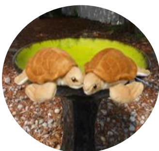
Tim and Tina Turtle Collaboration (Be co-operative)