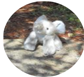
Ellie the Elephant Initiative/Independence (Think for yourself)