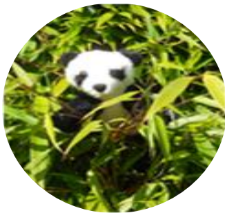
Ping the Panda Reflective (Take time to Think)

In the Preparatory Department, each Mindset is related to a character and a story to give the girls an example of the learning behaviour in an understandable context.