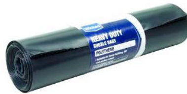
Heavy duty rubble bags.