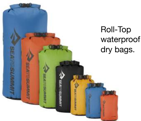
Roll-Top waterproof dry bags.