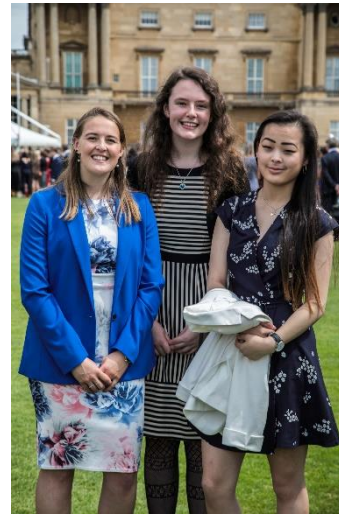
Gold Award ceremony at Buckingham Palace - 2019

2017 – 2018 26 Bronze, 4 Silver & 8 Gold 2018 – Present 28 Bronze, 4 Silver & 10 Gold