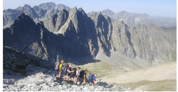
Gold participants on their qualifying expedition in the Tatra mountains, Slovakia - 2018

Since its creation in 1956 by HRH The Duke of Edinburgh, the award programme has gone from strength to strength. Guided by a set of principles, and by the young people themselves, it is as relevant today as it was when it was first created.