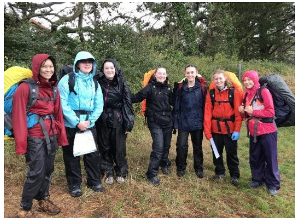
Bronze expedition in Guernsey – 2018

Activities for each of the Award sections take a minimum of one hour a week over a set period of time, so it can fit in around academic study, hobbies and social lives. Development and regular progress must be shown and any award started must be completed by the participants 25 th birthday.